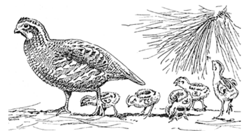
Survival of bobwhites during 2006 was higher during January through August, which helped to boost production this year over the 5-year average.

the last couple of years but still over one bird/acre. Currently we are concerned about the light cover and its effect on hunting quality as well as carryover birds for next years breeding season.”