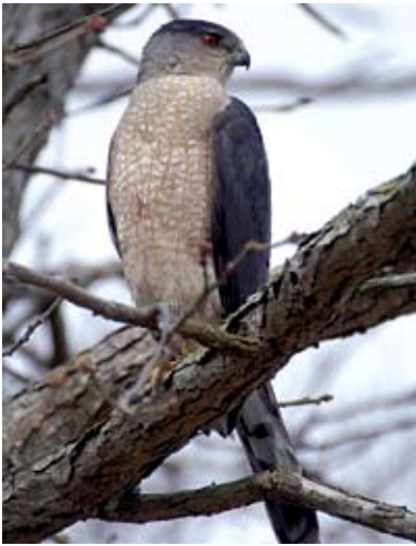
We know predation of bobwhites by Cooper's hawks varies over time in the Red Hills. However, why predation varies over time is not well understood.