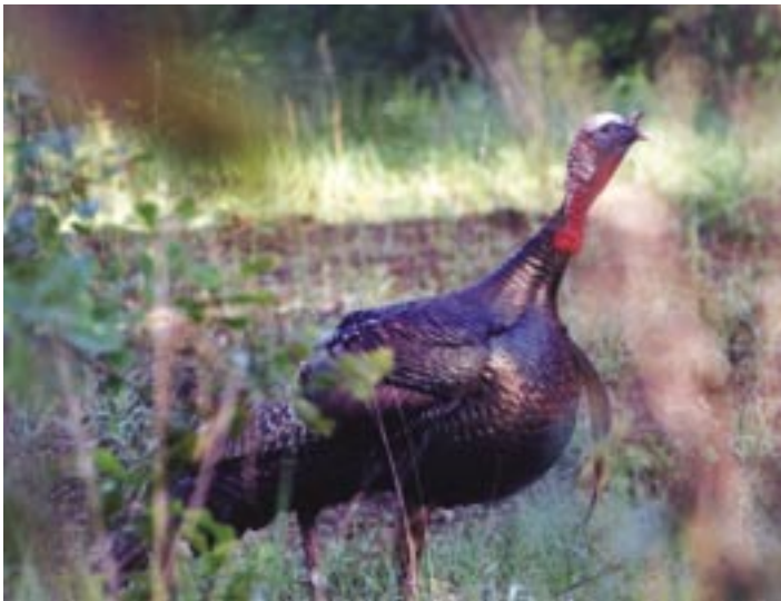
Wild Turkey.

The Game Bird Lab at Tall Timbers Research Station (TTRS) is cooperating with the FWC, Georgia Department of Natural Resources (DNR), University of Florida, University of Georgia and the Florida Chapter of the National Wild Turkey Federation (NWTF) to develop a new turkey research project on Pebble Hill Plantation and surrounding properties. The goals of this project will be to test methods to estimate turkey population size using cameras at bait stations, develop simple measures of habitat quality to assist public and private land management, and to determine how burning affects gobbler and hen movements in the spring. Also of interest is the nesting ecology of turkeys. Turkeys will be leg-banded so please report any leg-banded gobblers harvested over the next several years to Tall Timbers.