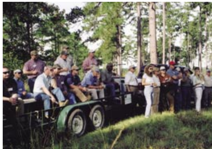
Fall Field Day registrants on the field tour at Horseshoe Plantation, October 30, 2002, listen to presentations on bobwhite management, timber management, fire and quail, and white-tail deer management on this tour stop.