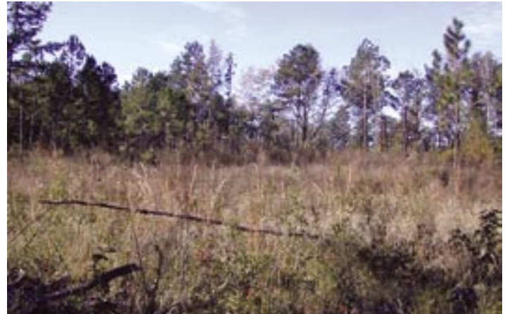
This mowed plot will burn well next spring.