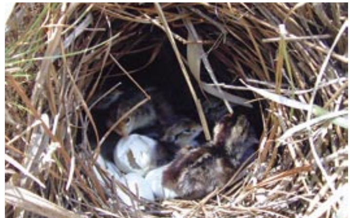
Within a couple days of leaving the nest, chances are good these chicks will be joined by unrelated chicks.

By capturing broods at three days of age and again at ten days of age, we are getting information on how much mixing of chicks occurs among bobwhite broods. This past season, on Tall Timbers, our genetics research team captured 44 broods at three days of age and 29 of these same broods at ten days of age. Surprisingly, 11% of three-day old broods and 52% of ten-day old broods included chicks from other broods. In most of these cases, only one or two adults were present during the brood capture. One chick was captured in three different broods in the same week. While the reason for brood mixing is unknown at this point, it is clear that adults may “loose” their young to other families as well as accidents and predators.