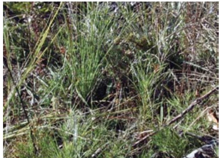
Seedling shortleaf, next to planted longleaf, in a mowed plot. Fire will kill shortleaf seedlings now rather than having to mow saplings later.