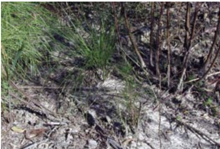
Herbicides have reduced the ability to burn this area. These sapling shortleaf are safe from fire for another year or two. Since shortleaf that survive two or three years re-sprout, this will be a long-term management issue for this stand.