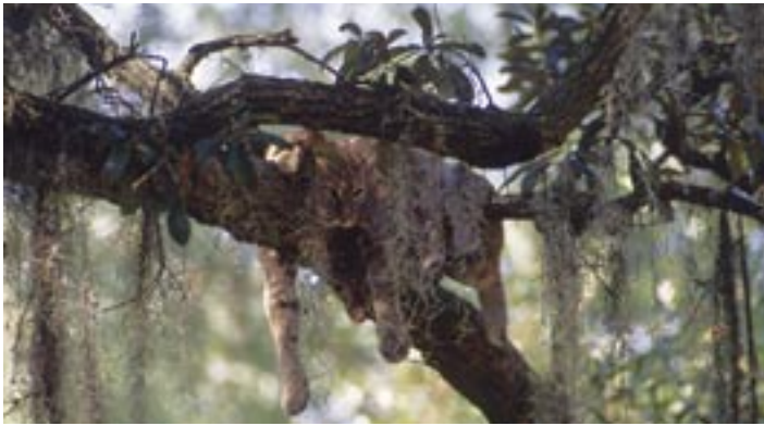
Hardwoods provide habitat for quail nest predators.

Feeding during the spring and summer will not only extend the nesting season by up to 6 weeks but will also keep hens in better condition to recycle after a lost nest. This has the effect of reducing the impact of a clutch lost to predators.