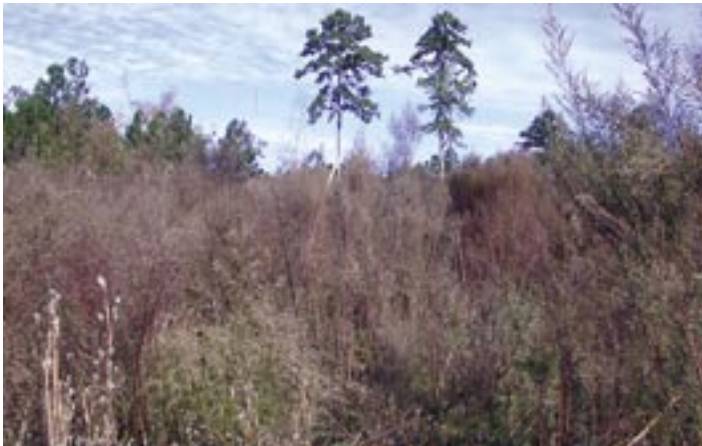
This backpack treated plot does not have the grasses needed to carry a fire.

Our preliminary results suggest mowing prior to planting longleaf is the least disruptive to maintaining annual fuels for burning. This should help us to control old-field pines in longleaf patches. After burning next spring we will be able to compare longleaf survival and competition control. Mowing has the second advantage of reducing the stature of existing old-field pine saplings. The photos below demonstrate the management problems that can come from dramatically changing the vegetation using herbicides when old-field pine competition is likely.